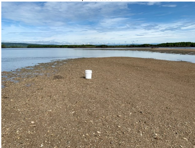
Fig. 3. Sampling place (sand flat) at Perico island