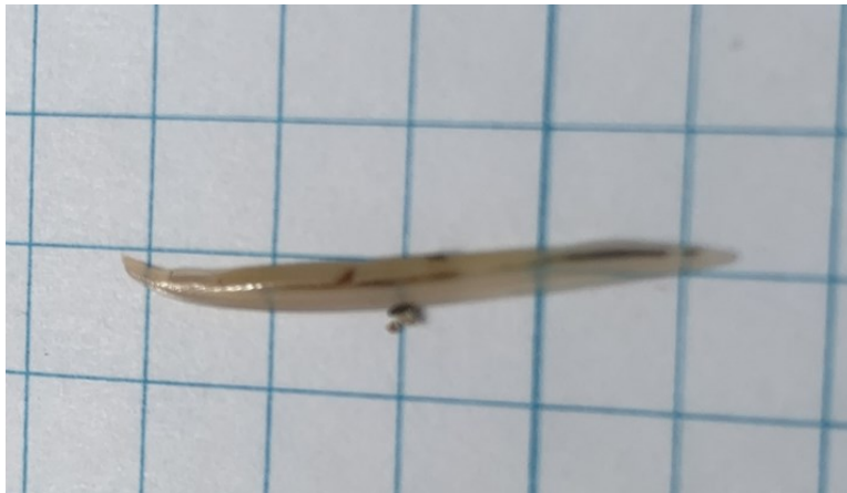
Fig. 2. Specimen of B. californiense collected at a sand flat at Perico island, La Unión Bay. Length: 12,5mm (each square: 3mm). 19-October-2020

Material examined. Seven specimens were collected with a Petite Ponar Grab at Puerto El Triunfo, Jiquilisco Bay (13° 15' 58.3" N, -88° 33' 8.2" W) from two samples of sediments at a depth of 7 meters in April 2018. Length oscillated from 14,9 to 34,2mm (average ( \bar{X} ) = 24,8; SD = 6,8). Also, three specimens were taken from intertidal mixed sediments at Perico island, La Unión Bay (13° 15' 59.1" N, -88° 33' 8.2" W) during November 26th, 2019. Length varied from 24,8 to 28,6mm ( \bar{X} = 27,0; SD = 2,1mm). In both cases sediments were sandy-muddy. Figures 2 and 3 present respectively a fresh specimen collected at Perico island, and the sand flat of the same island.