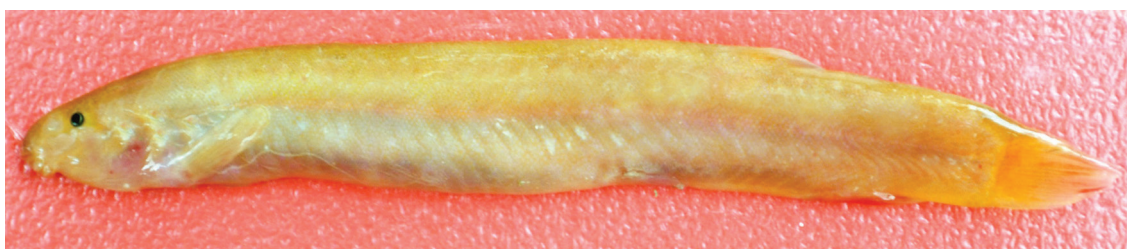
FIG. 2. Lateral view of Pangio pangia (47,41 mm SL).

Color version of this photograph, available at: http://investiga.uned.ac.cr/revistas/index.php/cuadernos/index .