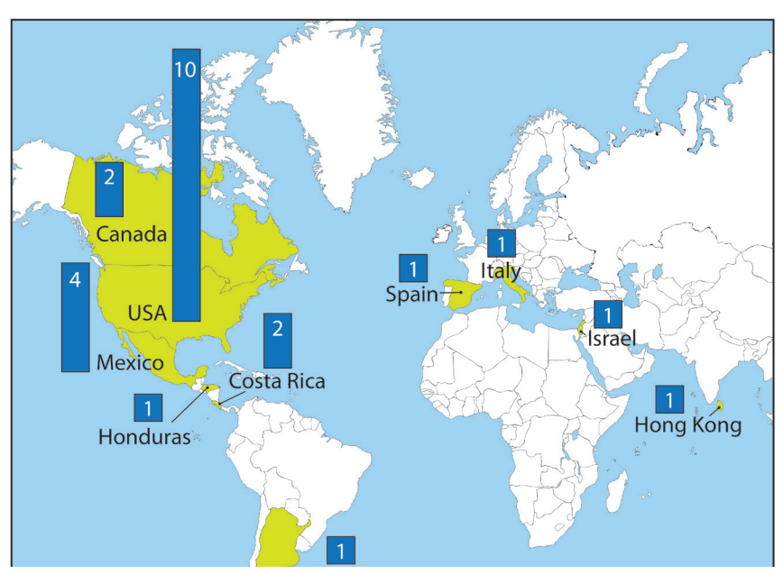
Fig. 1. Projects per country around the world.

Average productivity: The mean values per project were: total observations 431,09 (range: 2-953); species